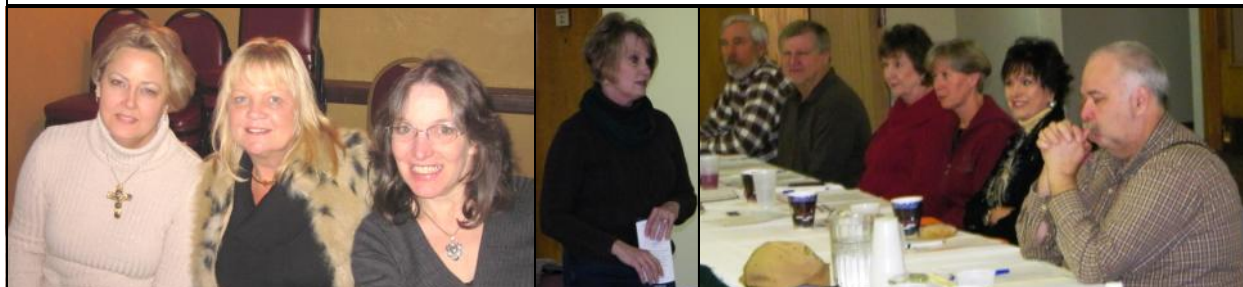
Show Me Postmaster