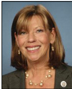
Jo Ann Emerson