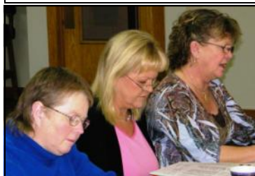
Show Me Postmaster